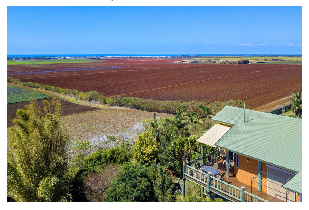
List Price: $790,000 - Contact Agent for Private Inspection

Great location with 180-degree ocean views from the Port to Elliott Heads, all the agricultural land below it is just magnificent. Positioned centrally between Bundaberg and Bargara Beach with the most amazing views over the Ocean to the Horizon, this cleverly designed 2 storey plus home is an entertainers delight and takes advantage of the easterly breezes so no need for air conditioners. The amazing house is also protected from the cold westerly breezes of wintertime and the hot afternoon sun.